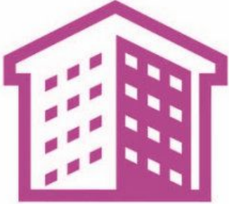
Preservation Trust (25K HU)

3.7 MW of solar has been installed or is in construction in PACT sites