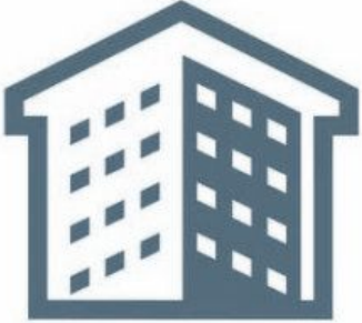
Permanent Affordability Commitment Together (62K HU)

NYCHA has 3 megawatts (MW) of roof leases at 5 developments completed, and two leases for an additional 3.1 MW were signed this year