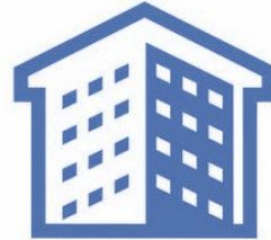
Permanent Affordability Commitment Together (62K HU)