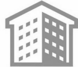
Preservation Trust (25K HU)