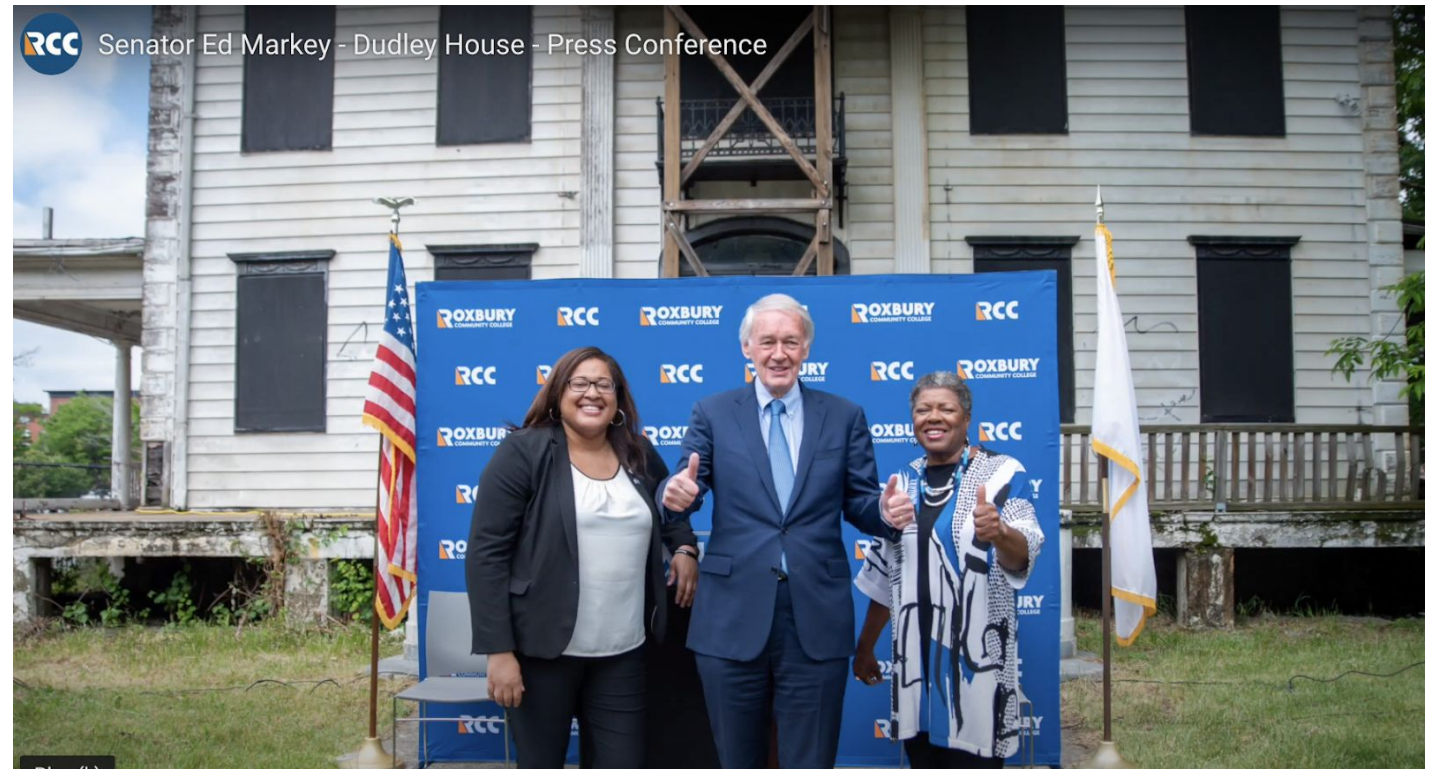
Growing the new green energy workforce at at RCC Dudley House