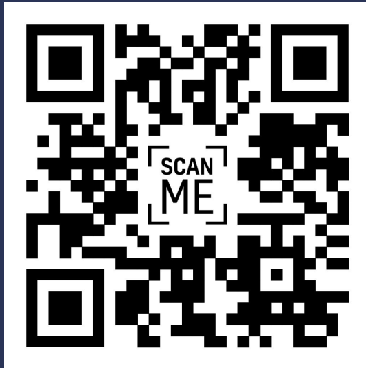
Midwest Regional Hydrogen Economy White Paper