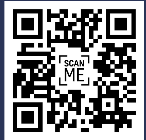
Midwest Regional Hydrogen Economy Global Benchmarking